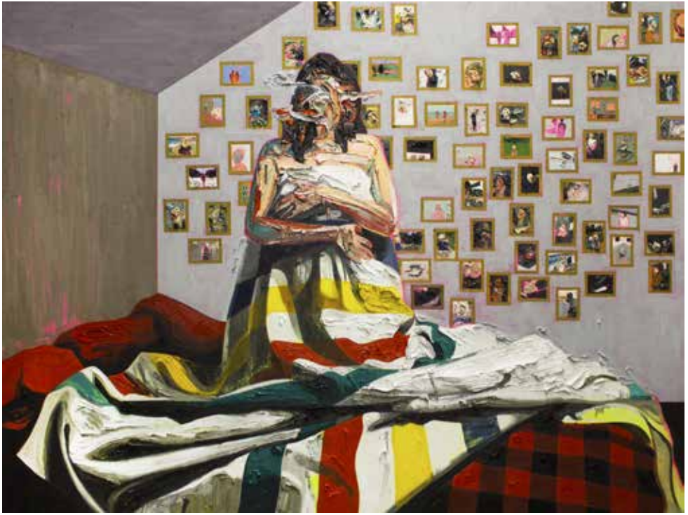
Above: Kim Dorland, Bay Blanket 3, 2014, oil and acrylic on linen over wood panel, 72" x 96"