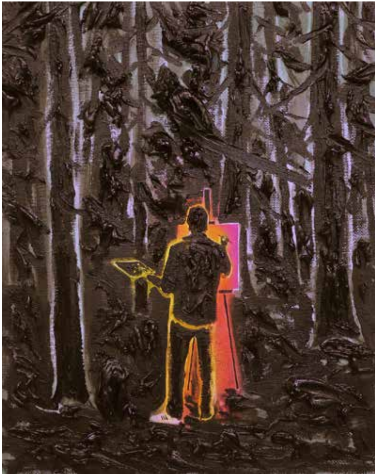
Kim Dorland, Untitled , 2013, oil and acrylic on just over wood panel, 20" x 16"