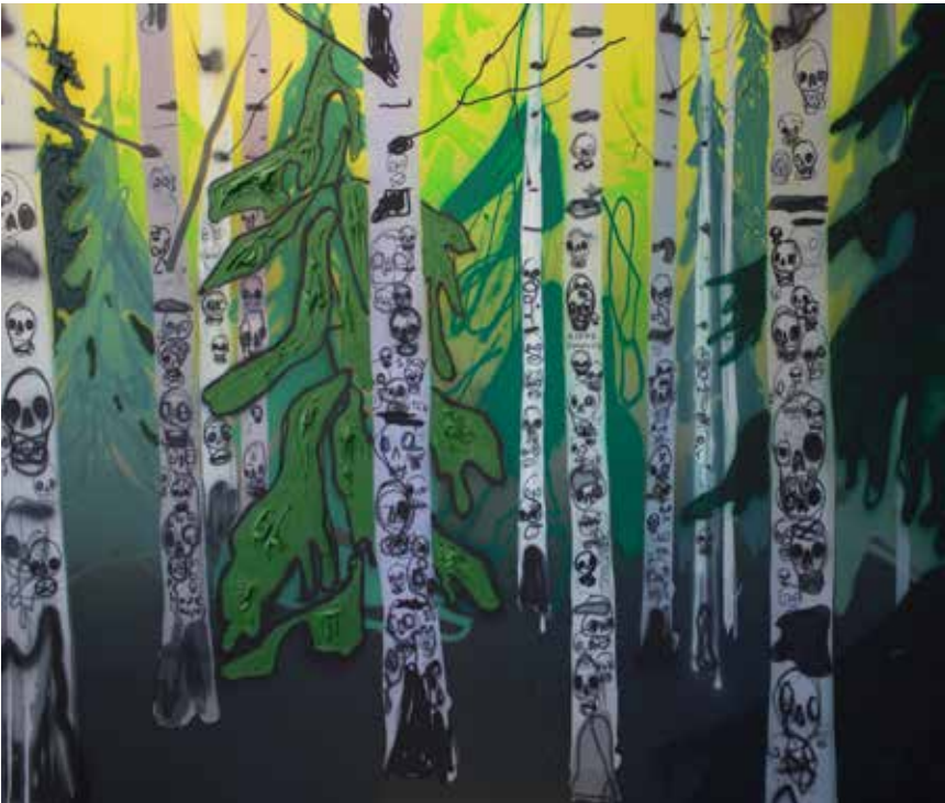
Left: All work and no play...2, 2016, oil and ink over iPad print on polyester, 60" x 72"