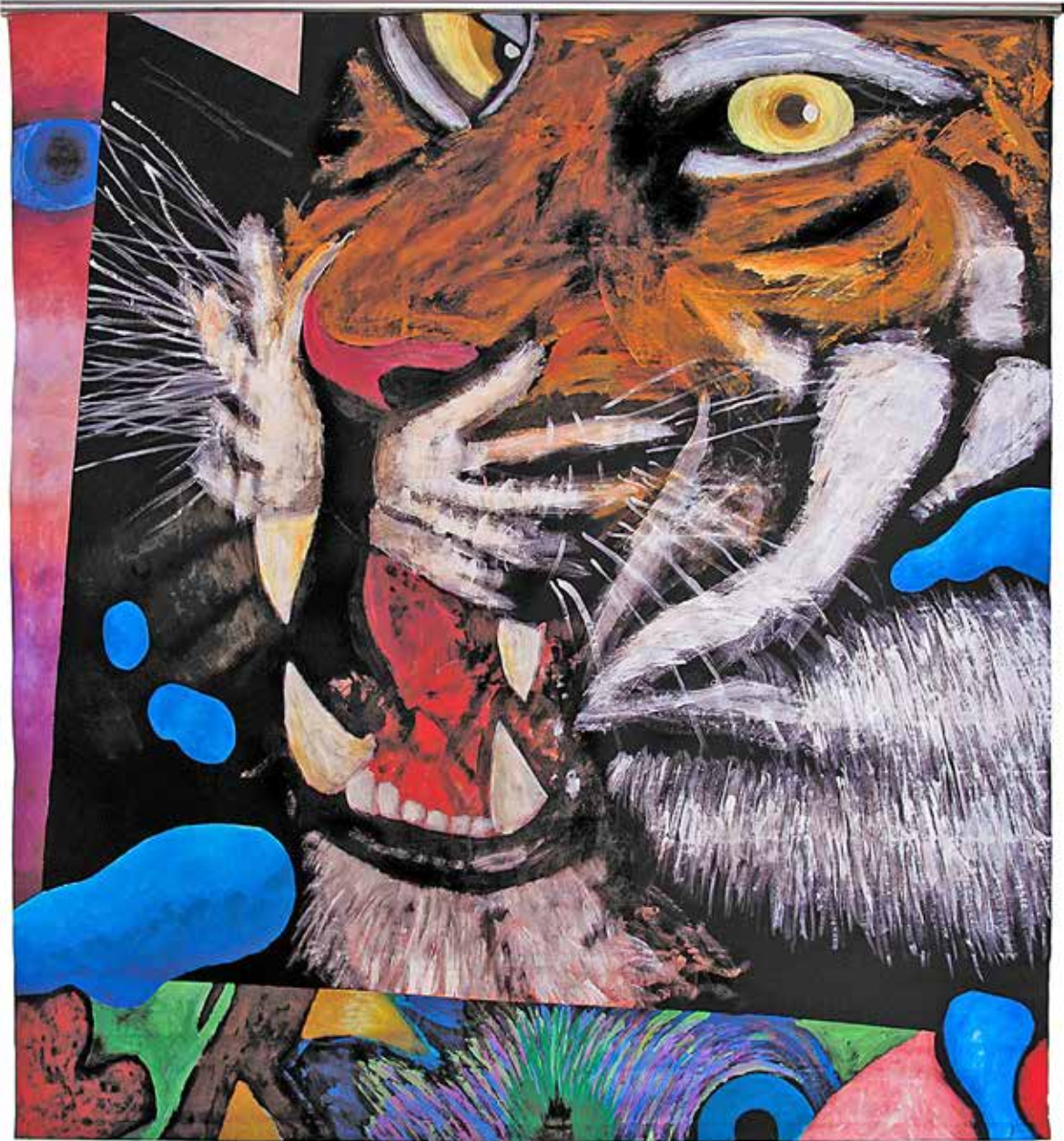
Tigers Time, 2009, acrylic on treated cotton, 74" x 70" (188 x 178 cm)