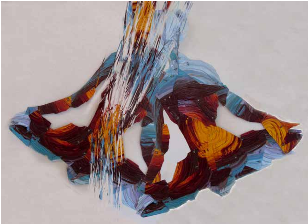
First Meditation Double Diagonal, 2017, acrylic, Plexiglas, archival inkjet pigments, pencil, 18" x 24"