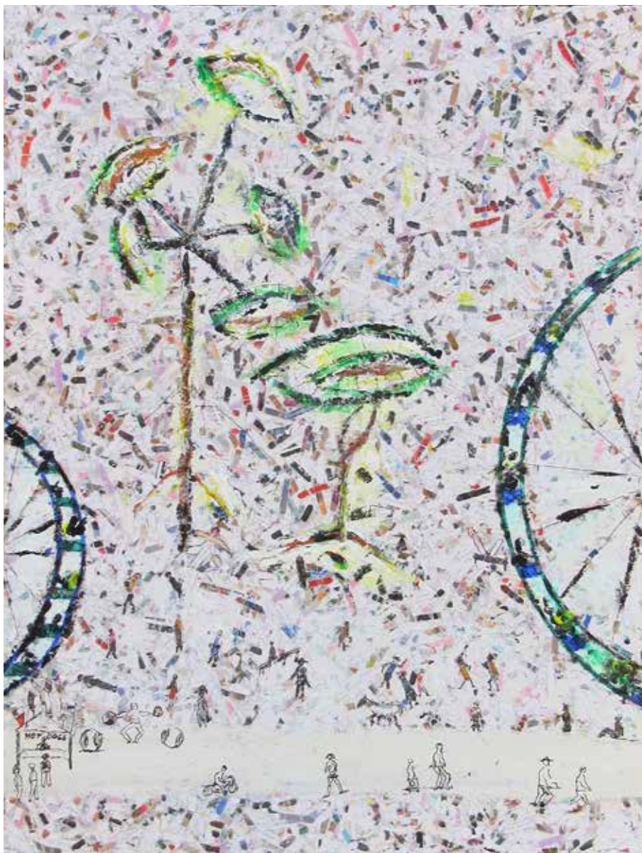
Leon Rooke, Loop-O-Planes (work in progress), 2017, oil, acrylic, and marker on dArt International paper, 21" x 16"

Two new books: Swinging Through Dixie & A Good Baby (new ReSet edition) ...bristling...a breathless mix of Joycean tension, a dark, ferocious lyricism and a whopping good story. – Vogue funny and resplendent page after page. – Library Journal