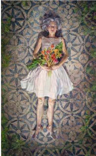
Left: Melanie Vote, Place Like Home, 2016, oil on linen on panel, 16" x 25"