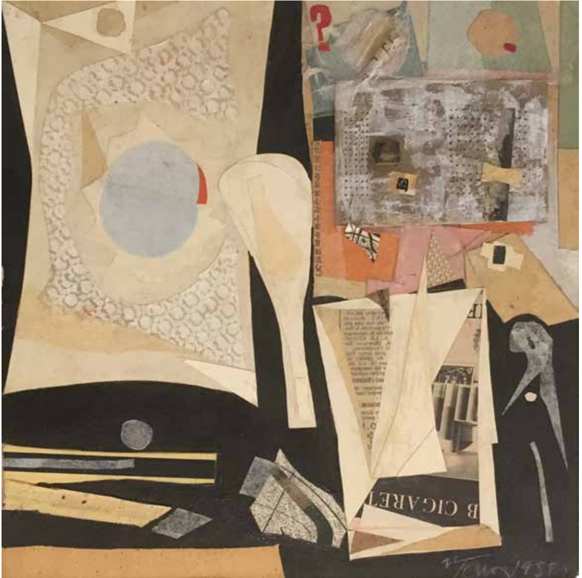
Untitled, 1958, mixed media collage on board, 10.25 x 10.25 inches

Opening Reception: Saturday, September 9th, 2017 2 – 6 PM Exhibition Runs: September 9 – October 14, 2017