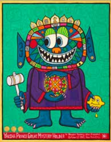
Above: Rodney Alan Greenblat, Yaksha Prince Great Mystery Holder, 2012, acrylic on canvas, 30" x 24"