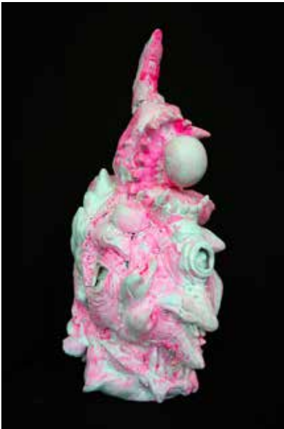
Right: Janice Sloane, Roamer, 2016, vinyl Halloween masks, steel pins, plastic bags, styrofoam, acrylic paint, 20" x 9" x 12"