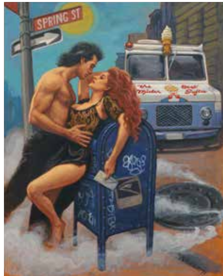
Above: Roman Turovsky, Trastevere, 2016, archival print, 14" x 11"