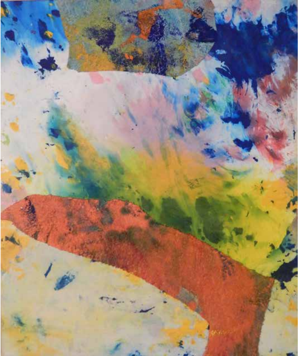
Untitled 2219, 2016, Mixed Media on Canvas , 28"H x 24"W