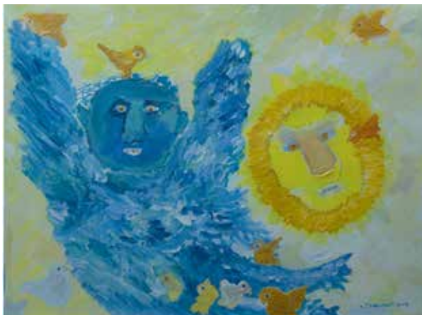
Artist as a Younger Angel , 2009, acrylic on canvas, 18" x 24"

Angels, Demons and Spirits May 7 – 28, 2016