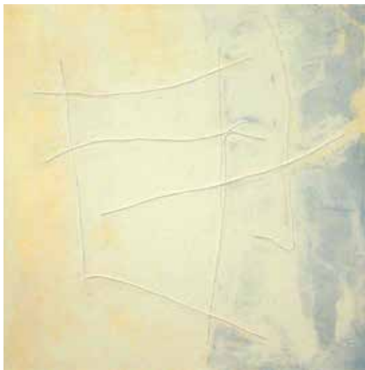
The Net , 2016, mixed media on canvas, 18" x 18"