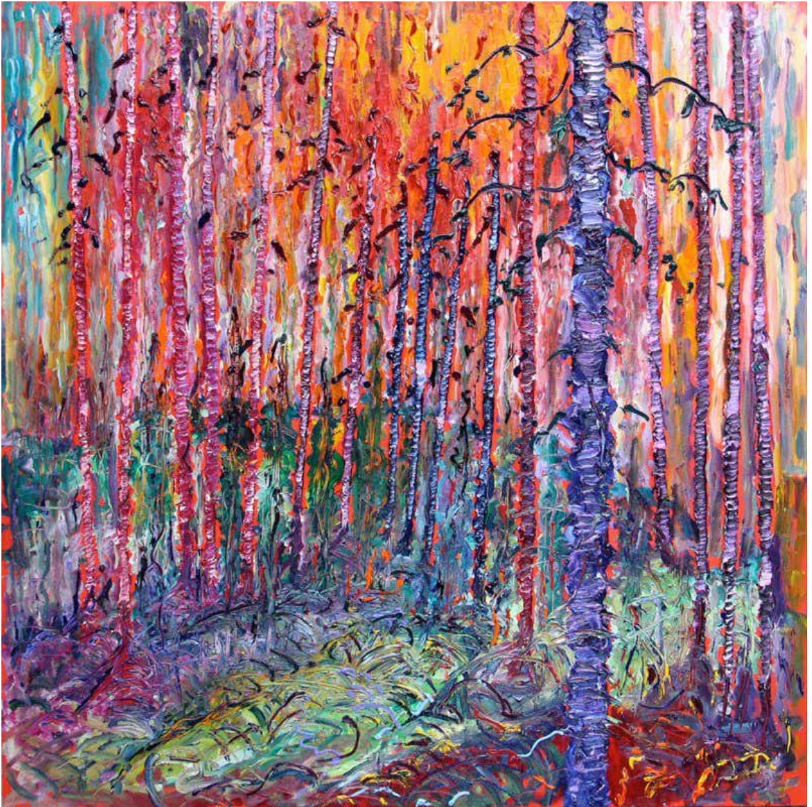
B.C. Fire, 2015, oil on canvas, 72" x 72"