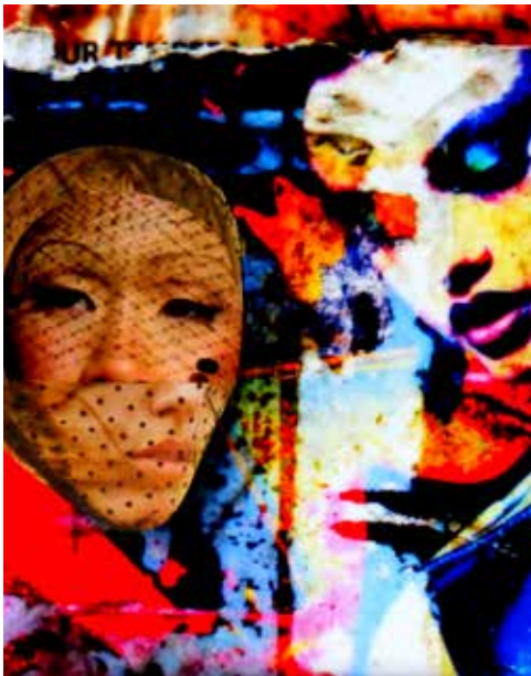
Looking , 2016, digital collage edition of 3, 7" x 5"