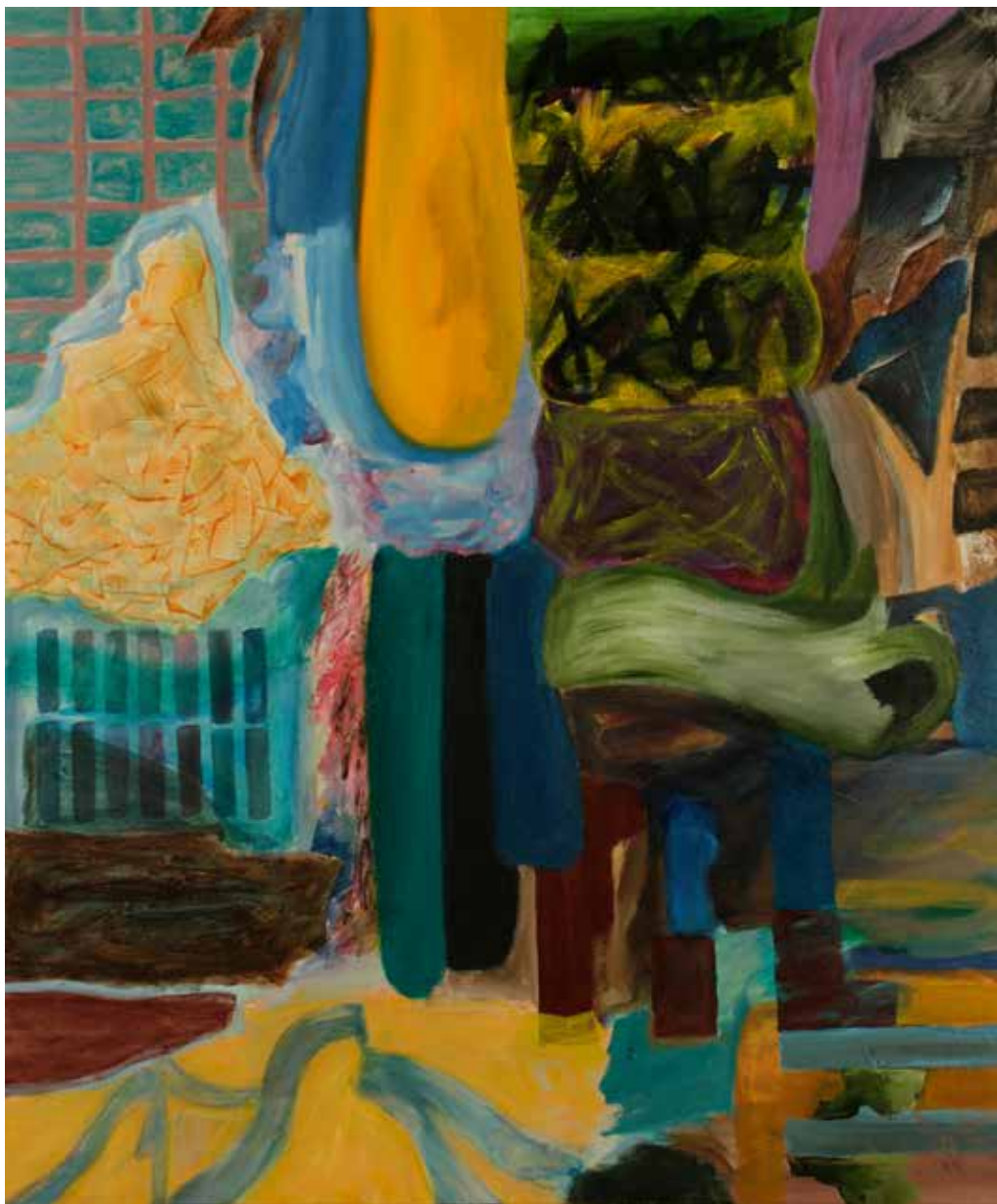
Writing on the Other Side, 2014, acrylic on canvas, 36" x 30"