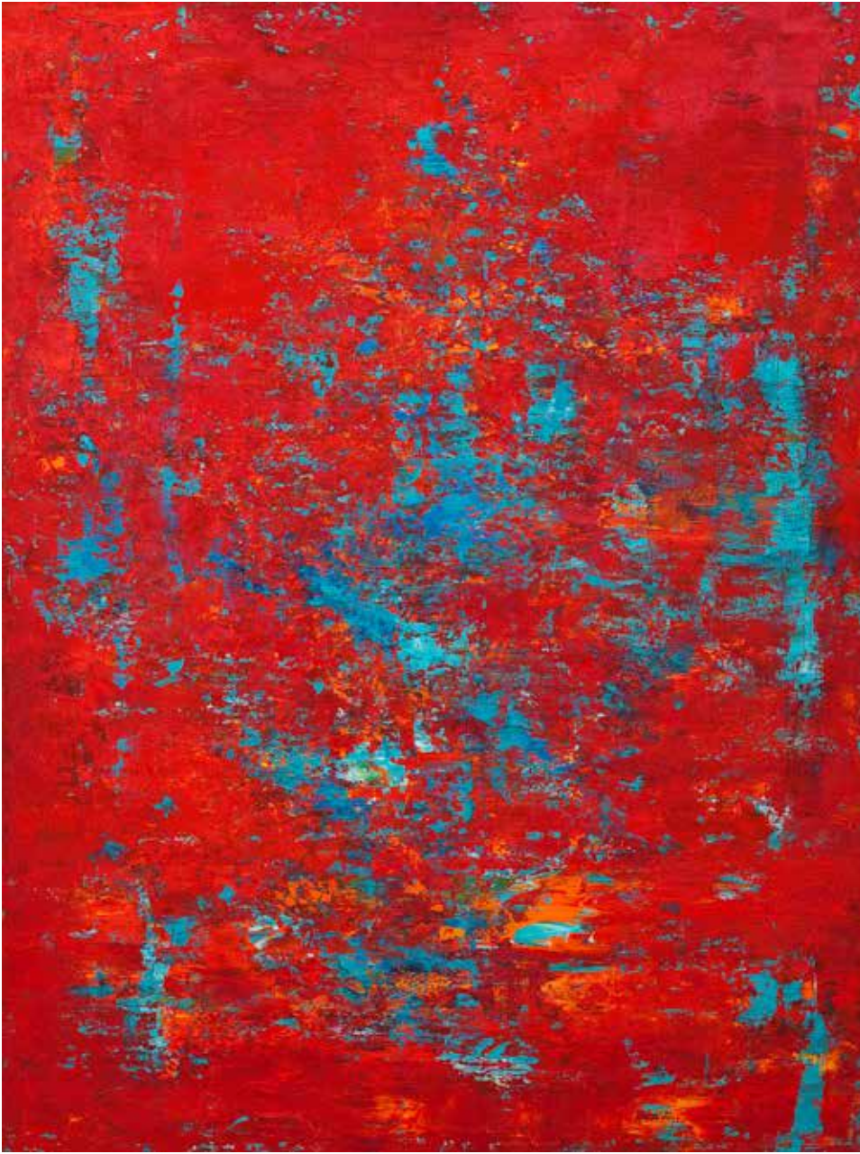
Perhaps the Terrace of this Garden Overlooks Only the Lake of Our Minds, 2016, oil on canvas, 48" x 36," 120 x 90 cm Title from 'Invisible Cities - Italo Calvino

The roots of McLeod's impulse to paint dig deep into the soil of the primitive' – Steve Rockwell