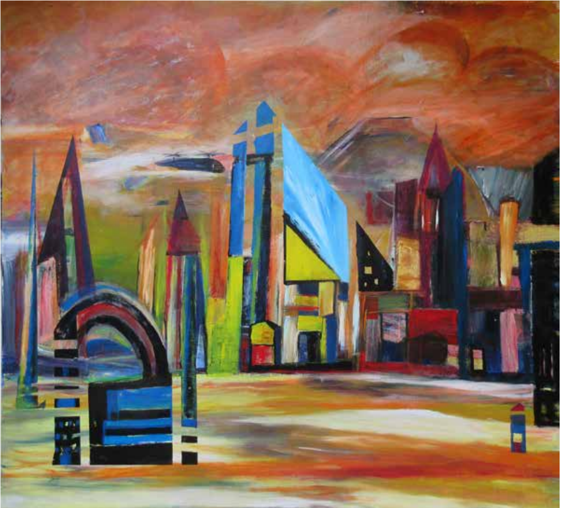
Leon Rooke, Piazza , 2015, oil and acrylic on canvas, 53" x 60"

Fabulous Fictions and Peculiar Practices link: http://porcupinesquill.ca/fabfic Visual art link: http://www.franhill.ca