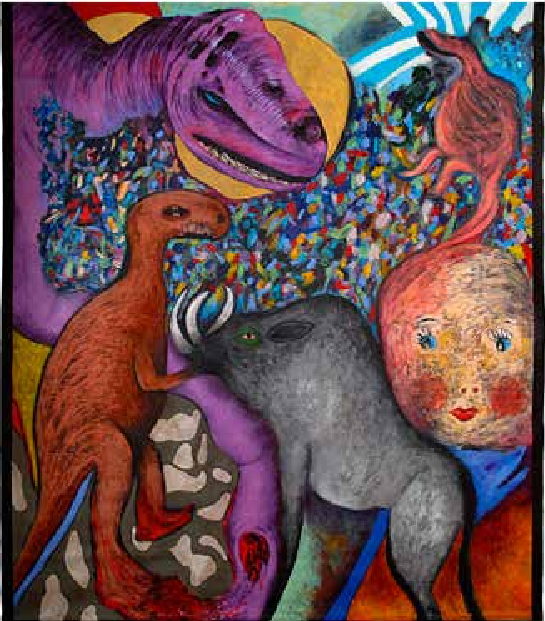
Fightback (from the Toybox), 2009, acrylic on treated cotton, 74" x 64" (188 x 162 cm)