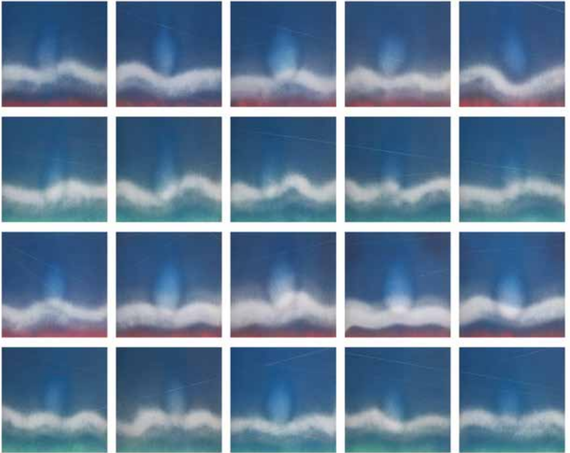
Waves II - 20 panels, 2016, 12 x 12 inches each, enamel and pencil on paper

Lowe's solo exhibitions include The Morris Museum of Art, Augusta, GA; The Hardin Center for the Arts, Gadsden, AL, both open in 2016; Florida Southern College, Lakeland, FL; The White House, Washington, DC; and Cramer Gallery, Washington, DC. Group exhibitions include the Corcoran Gallery of Art, Washington, DC; Polk Museum of Art, Lakeland, FL; Mobile Museum of Art, Mobile, AL; and the Birmingham Museum of Art, Birmingham, AL