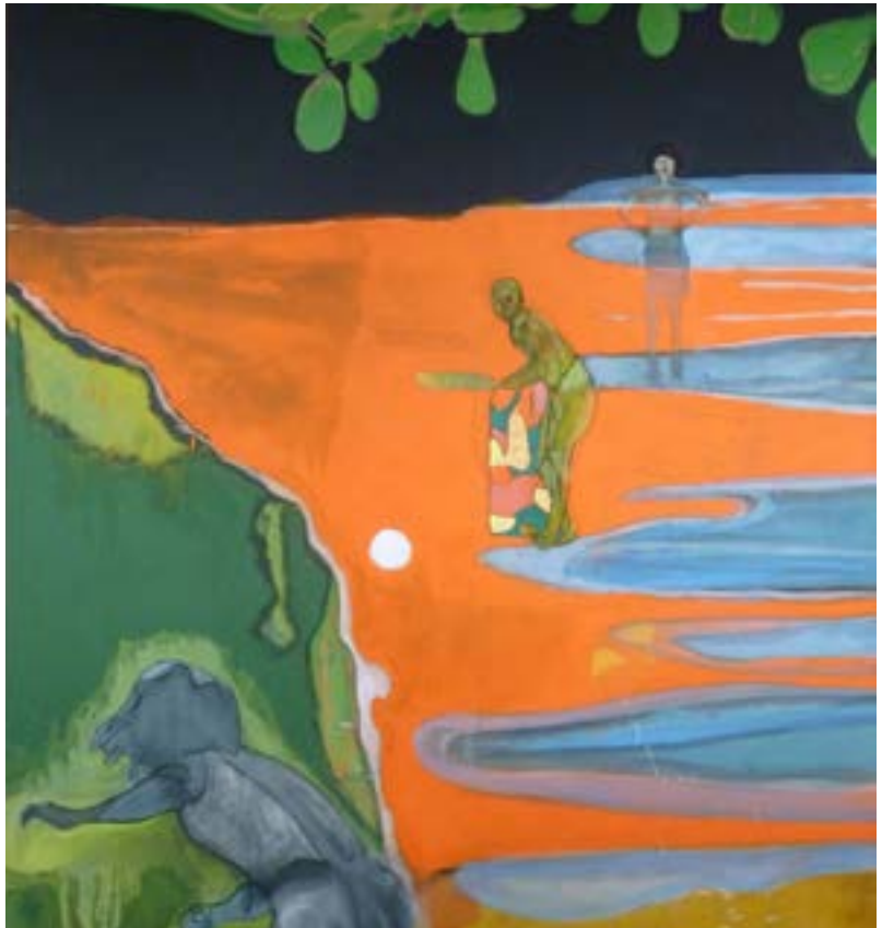
Peter Doig, Cricket Painting (Paragrind) (detail), 2006–2012, oil on canvas, 118.25 x 78.75 in. (300.4 x 200 cm.)

dART INTERNATIONAL 750A St. Clair Ave. W., Toronto Ontario, Canada M6C 1B5 Tel: 416-651-5778 info@dartmagazine.com www.dartmagazine.com